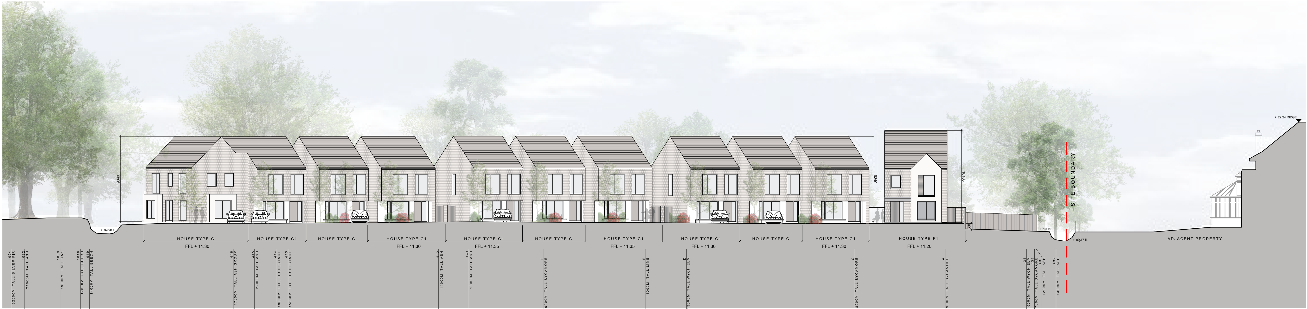
SITE SECTION J - J SCALE: 1:200 NOTE: SEE LANDSCAPE ARCHITECTS DRAWINGS FOR BOUNDARY TREATMENTS SEE ARBORISTS REPORT FOR DETAIL ON EXISTING TREES DOTTED RED LINE INDICATES SITE BOUNDARY