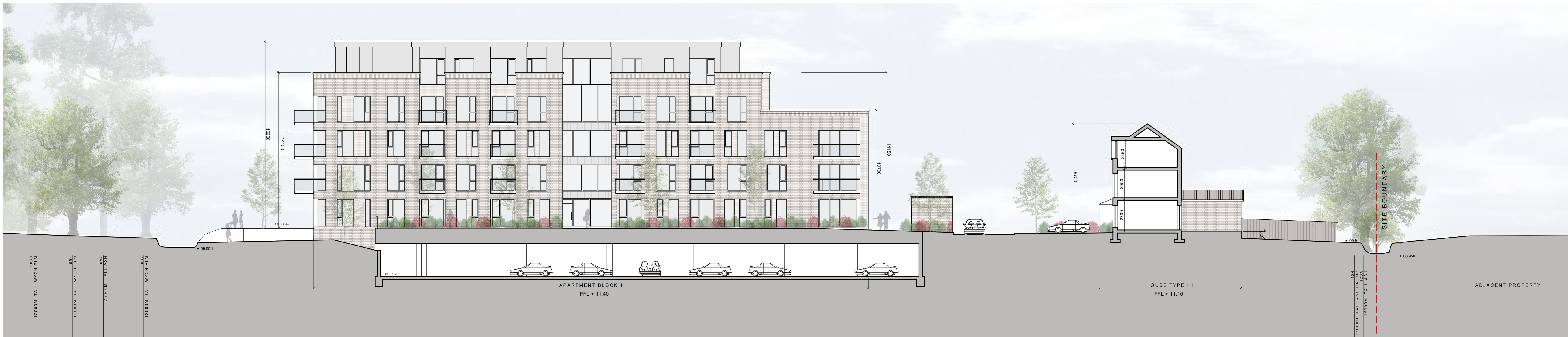
SITE SECTION K - K SCALE: 1:200 NOTE: SEE LANDSCAPE ARCHITECTS DRAWINGS FOR BOUNDARY TREATMENTS SEE ARBORISTS REPORT FOR DETAIL ON EXISTING TREES DOTTED RED LINE INDICATES SITE BOUNDARY